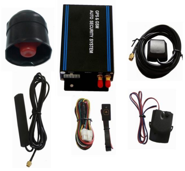
Data as shown in the table as below:

GPS can track the exact position of a car and GSM (GPRS) can achieve communications. There are five input ports and one three-way output control.